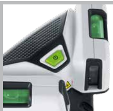
Bubble levels to adjust the device