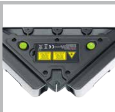
Lay edges and contact surface