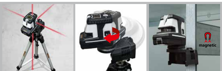
Plumb and ceiling point

Packing dimension (W x H x D) 440 x 370 x 110 mm