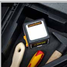
Fits in any toolbox