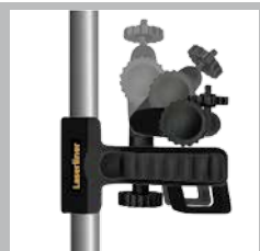
Adjustable and free mounting options