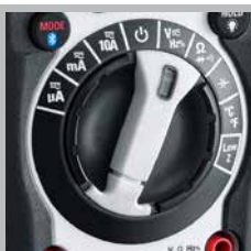
Easy-to-use rotary function knob