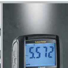
Super-bright, integrated flashlight