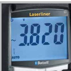
Large LCD display with background lighting