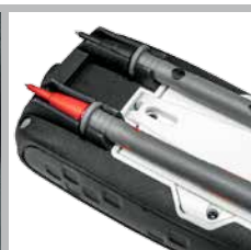
Test prod holder