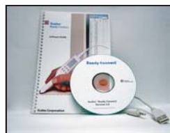
*Computer Interface Kit - connects to any Windows™ application