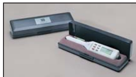
Hard Plastic Protective Case - protect your investment